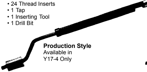
Production Style Available in Y17-4 Only