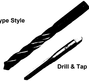
Drill & Tap