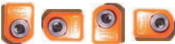
0 grade 90 grade 180 grade 270 grade