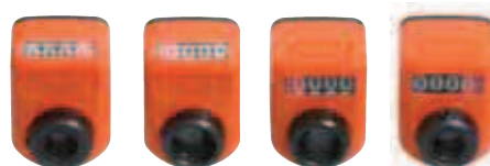
A* B C D