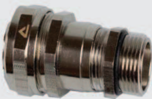
ISO cable-hose fitting, compact, male, nickel plated brass, double seal according EN 45545-2, HL 1 / HL 2 / HL 3, table R22 and R23 (incl. connection set).